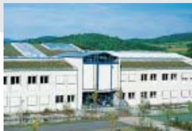
Standort BARTEC Gotteszell