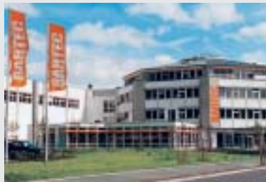
Headquarters in Bad Mergentheim

Our innovative spirit and consistent product development are the basis for innovative solutions and exemplary performance at BARTEC. BARTEC sets standards in safety technology worldwide.