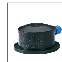
RFID cabinet door monitoring