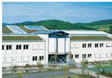
Site BARTEC BENKE Gotteszell