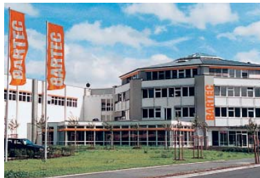
Headquarters in Bad Mergentheim

Our innovative spirit and consistent product development are the basis for innovative solutions and exemplary performance at BARTEC. BARTEC sets standards in safety technology worldwide.