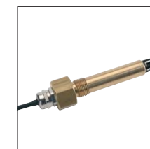
Wet leg sensor