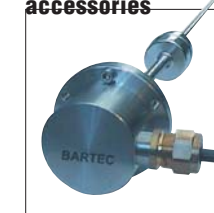
Electronic level measurement device